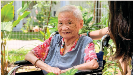
PAGE 02 | RESIDENT STORY