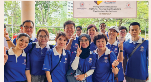
PAGE 06 | PRESIDENT CHALLENGE WALKATHON