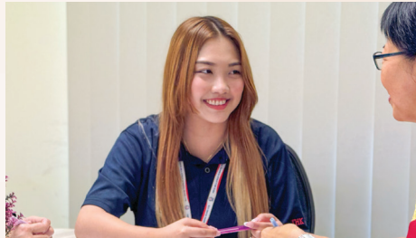
PAGE 03 | STAFF SPOTLIGHT